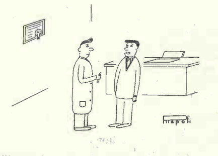
"I think I've got a few dry joints, doctor!"

It should be noted that the name given to this circuit could lead to misunderstanding. The purpose of the device is to detect the position of the source relative to the lobes. It therefore is in the form of a switch which switches the output to the recorder on and off in synchronism with the insertion of the additional half wavelength of feeder. This sampling of the signal will indicate whether the aerials are additive or subtractive and so lead to the tracing of the curve on the recorder. The reason for using two valves is to balance the circuit with reference to the switching generator.—EDITOR.